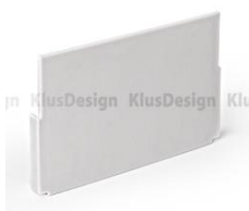
end cap TESE (24047)